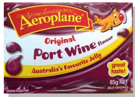
Mrs Malone's non-original entry

Taste and talent were intermingled with a range of humour, and interestingly enough, different vocal styles! Some of the contributions were creative and highly original, and some borrowed from well-known tunes - adding witty lyrics, whilst others took the lazy way out, producing packets of jelly and then expected diners to sing for their supper. The creative thought process, also included diners dressing up as their favourite port.