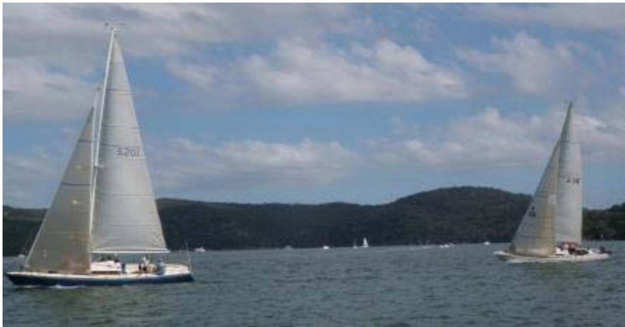
Crossbow chased All Our Girls all afternoon (Photo: Ines Stewart 19 April 2014)