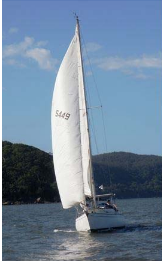
Star of the Sea chasing Blythe Spirit to the finish