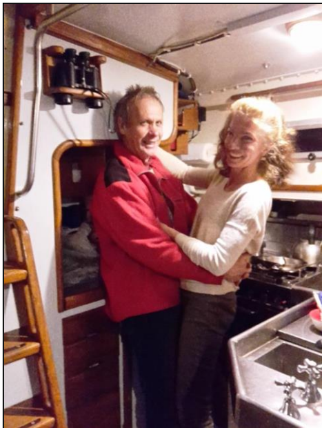
You've gotta love these guys...

the coming cyclone season (their change in plans were a minor disappointment to your Editor, as I was keen to use their arrival and catch up with relatives in Raiatea). Instead, they're heading for Nouméa in New Caledonia, hoping to leave their second cold, wet and windy New Zealand winter behind. They cleared customs last Tuesday, July 26 th , so should be well on their way for the 1300 mile journey, which from memory, they thought would take 11-14 days.