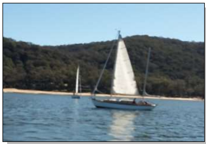
Tangaloo (R) waiting for Amoeba to start the proceedings