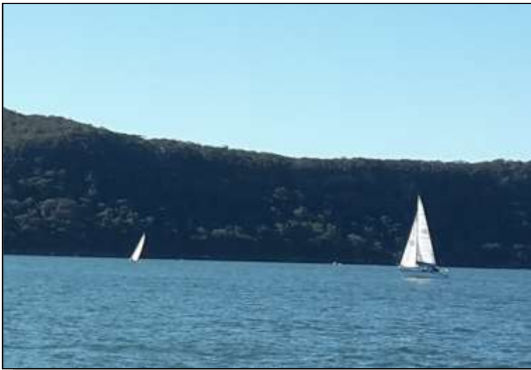
Cecilia and Waterplay off Walker Point

good grace, and the girls imploded into giggles, as they made it past with a few of metres to spare (who says that racing is supposed to be a serious business).