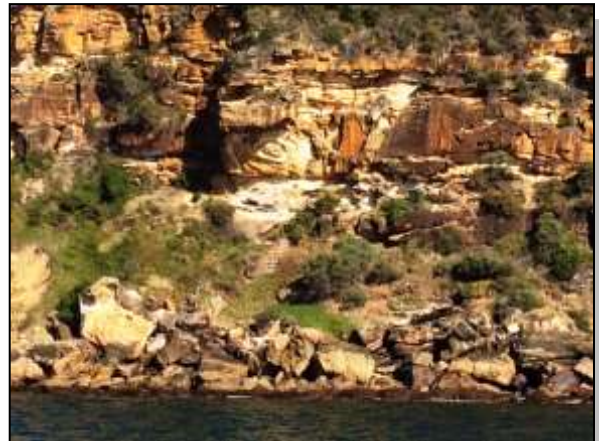
The rocks at Lion Island, bathed in winter sunlight Photos Libby Braybrooks 8.7.17