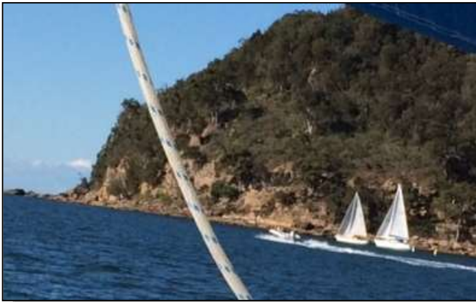
Cecilia and Waterplay rounding the Easterly mark