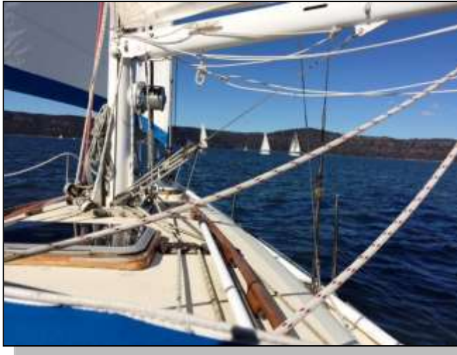
The start as seen from Star of the Sea

Cecilia pop her spinnaker, and Jia hard on the heels of Waterplay . From the cockpit of SotS , a close tussle between Waterplay and Cecelia could be seen as they rounded the East mark.