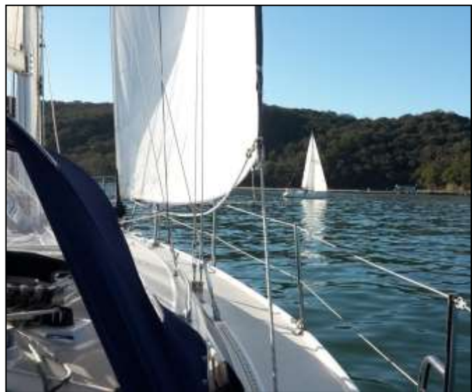
Amoeba trying in vain to round the finishing mark, with Aroha Nui 'attempting' to catch her